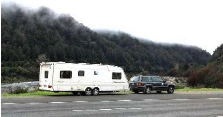
Photo: Taken outside Berlin's Cafe, Buller Gorge